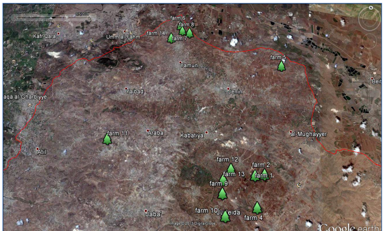
Distribution of demo field in the almond growing areas - northern part of west bank