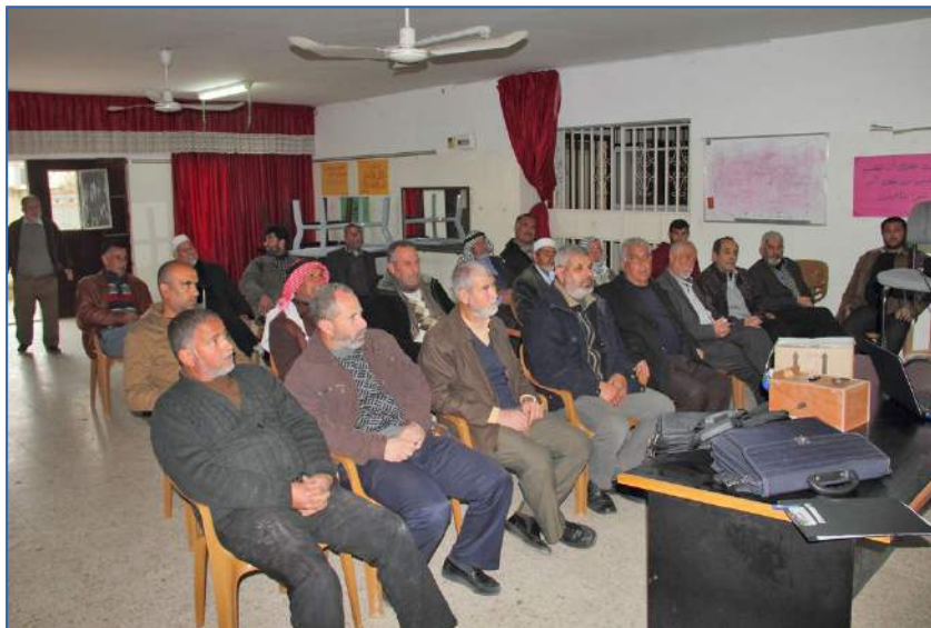
Almond seed wasp training in Silat alharithia and Ti'anik villages in Jenin province