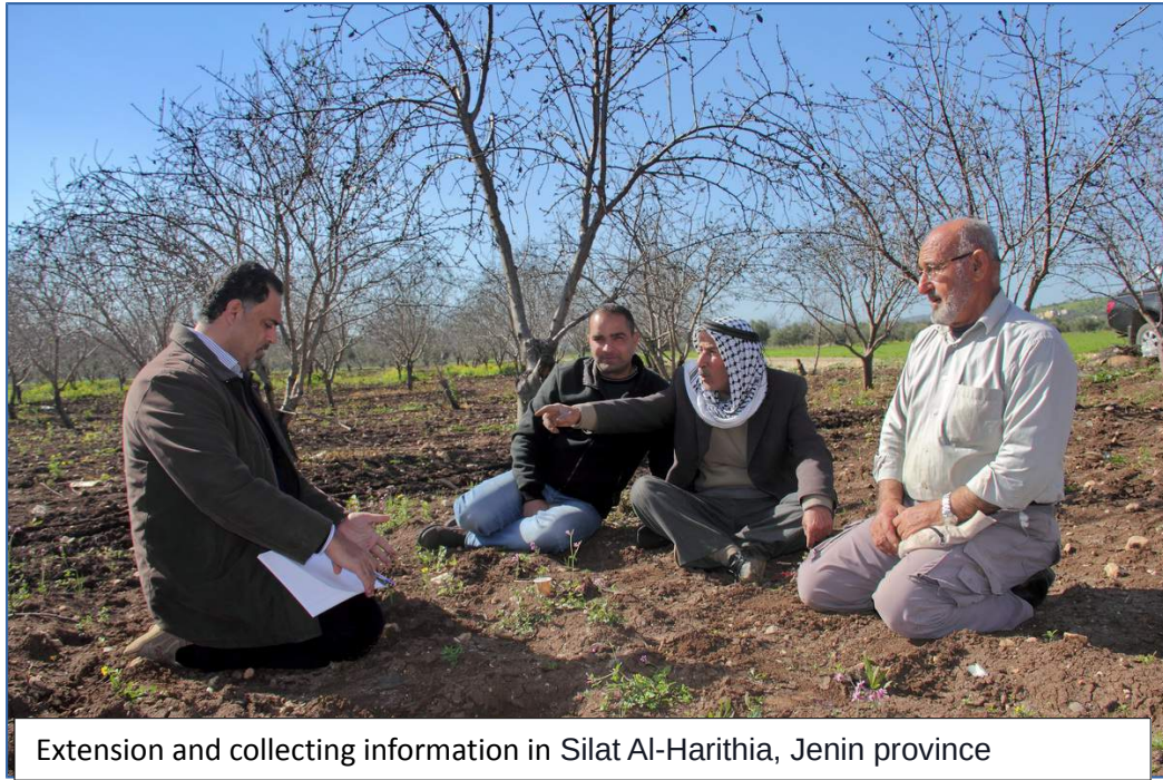
Extension and collecting information in Silat Al-Harithia, Jenin province