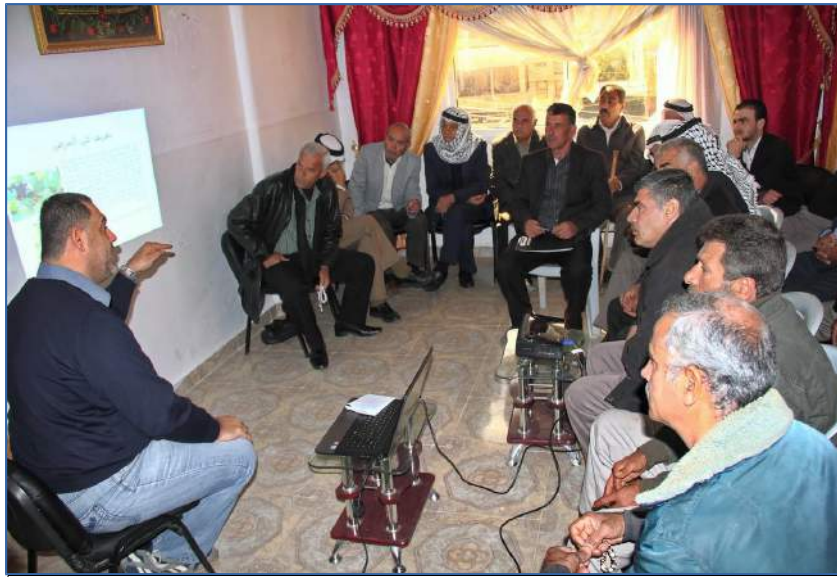
Almond seed wasp training in Aqaba village in Tobas province