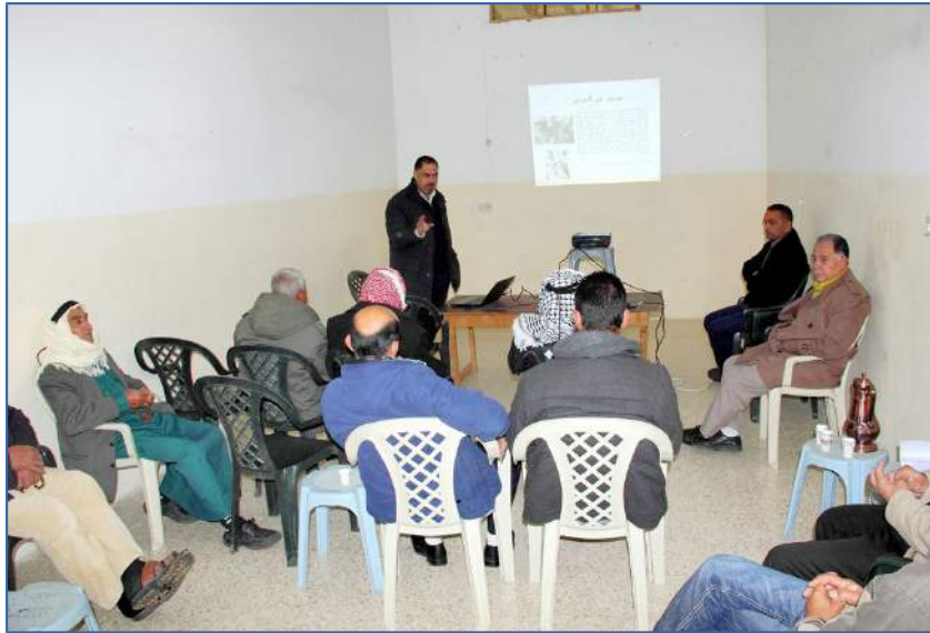
Almond seed wasp training in Yamon village in Jenin province