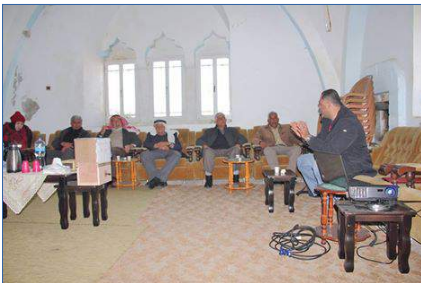
Almond seed wasp training in Sir village Jenin province

Six training courses for almond farmers on almond seed wasp and its control methods were organized and conducted in the areas and villages where most of the almond crop is cultivated in the northern part of the oPt.