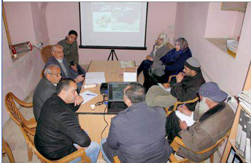
Almond seed wasp training in Faqqua village in Jenin province