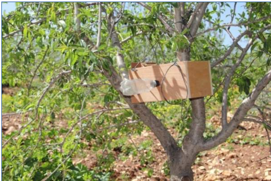
Traps installed in the demo fields to monitor the almond wasp