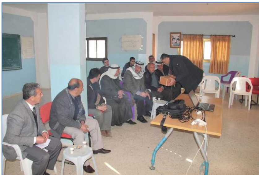
Almond seed wasp training in Judieda and Siris villages in Jenin province