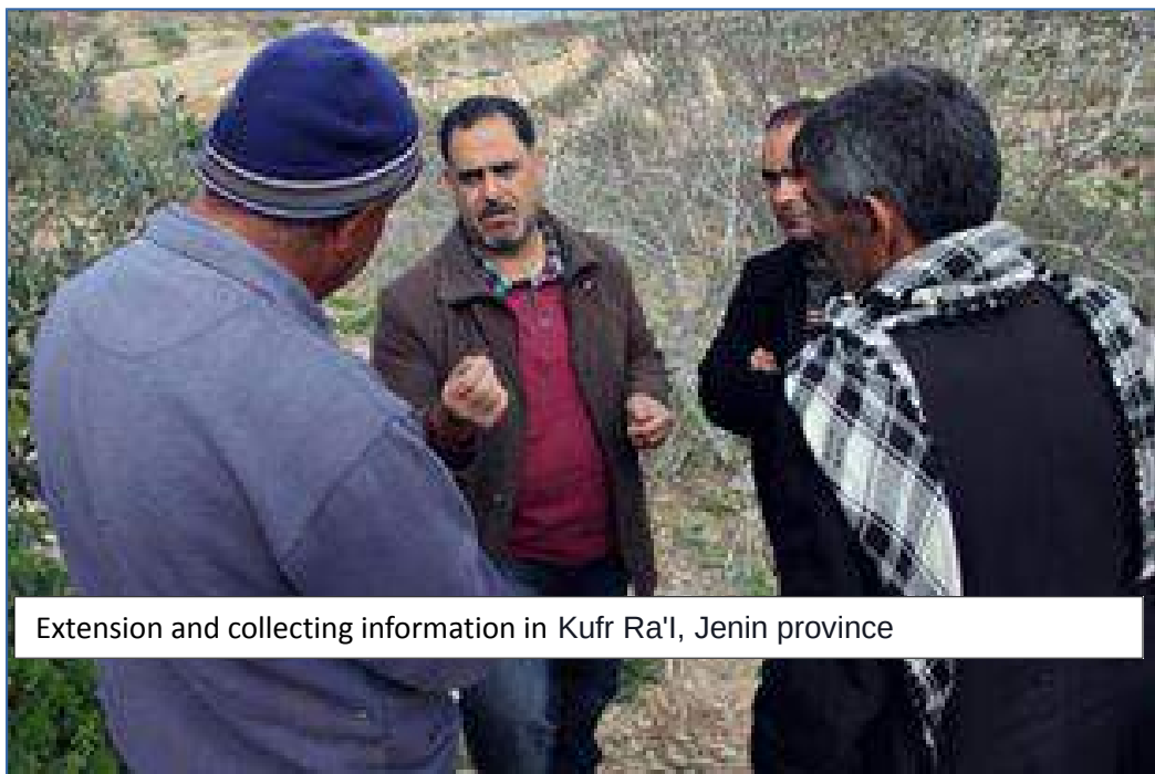
Extension and collecting information in Kufra Ra'l, Jenin province